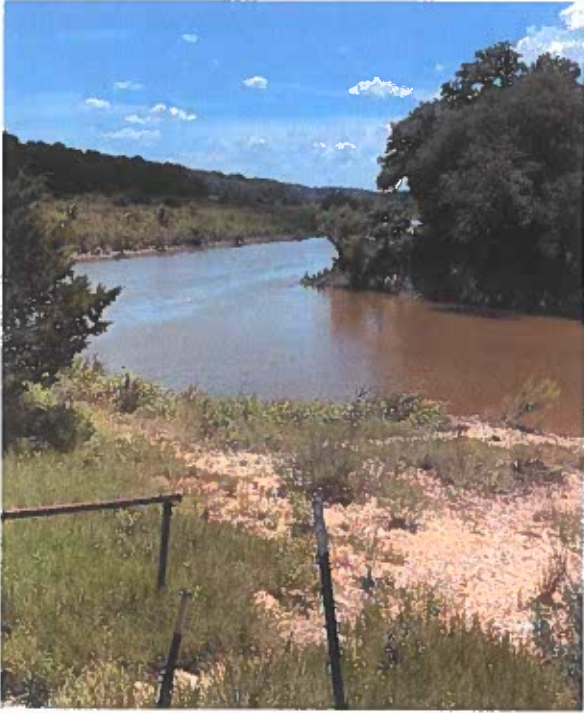
Bandera River Ranch

440 FM 3240 Bandera, Texas 78003 (830) 796-7260 Fax (830) 796-8262 www.bcragd.org