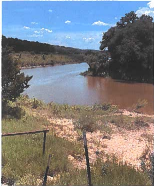
Bandera River Ranch

440 FM 3240 Bandera, Texas 78003 (830) 796-7260 Fax (830) 796-8262 www.bcragd.org