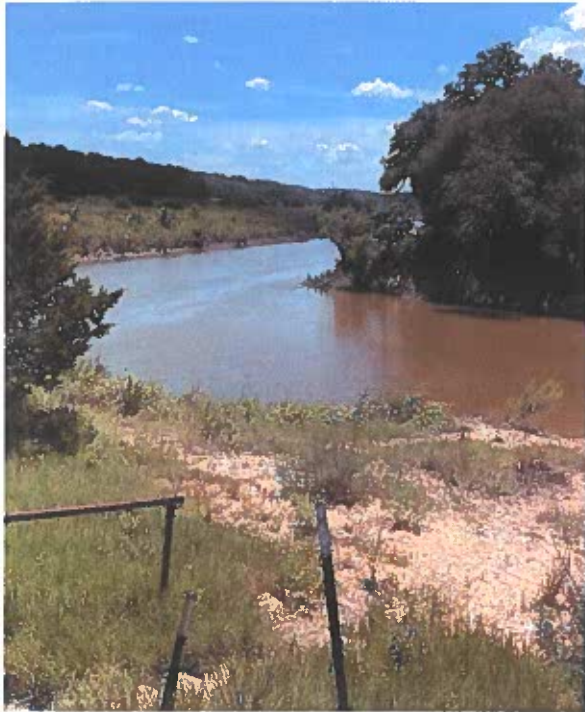
Bandera River Ranch

440 FM 3240 Bandera, Texas 78003 (830) 796-7260 Fax (830) 796-8262 www.bcragd.org