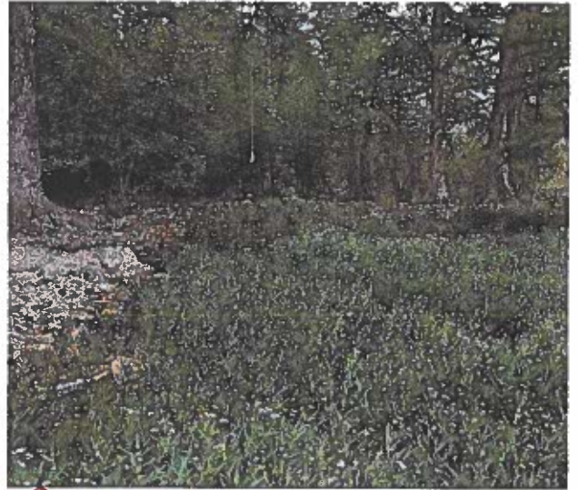
N. Prong Medina River at Wallace Creek