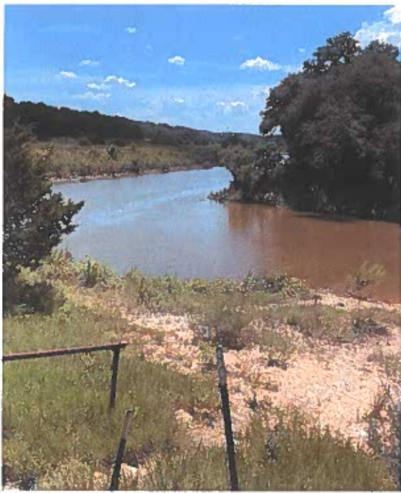
Bandera River Ranch