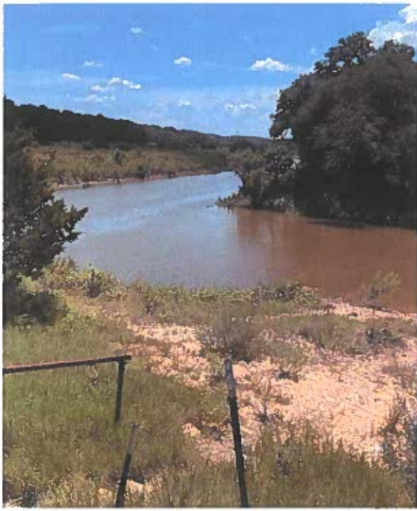
Bandera River Ranch