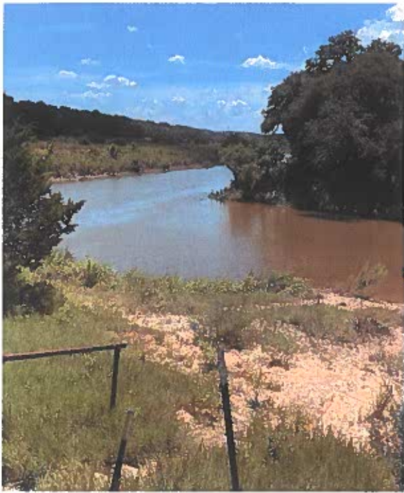
Bandera River Ranch