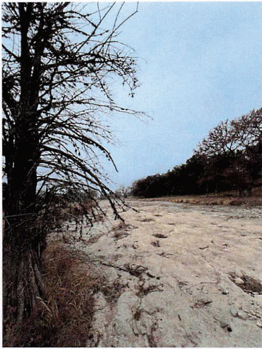
Sabinal River near Utopia, TX @ SH 187