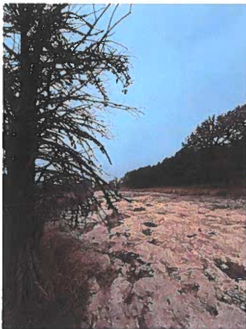
Sabinal River near Utopia, TX @ SH 187