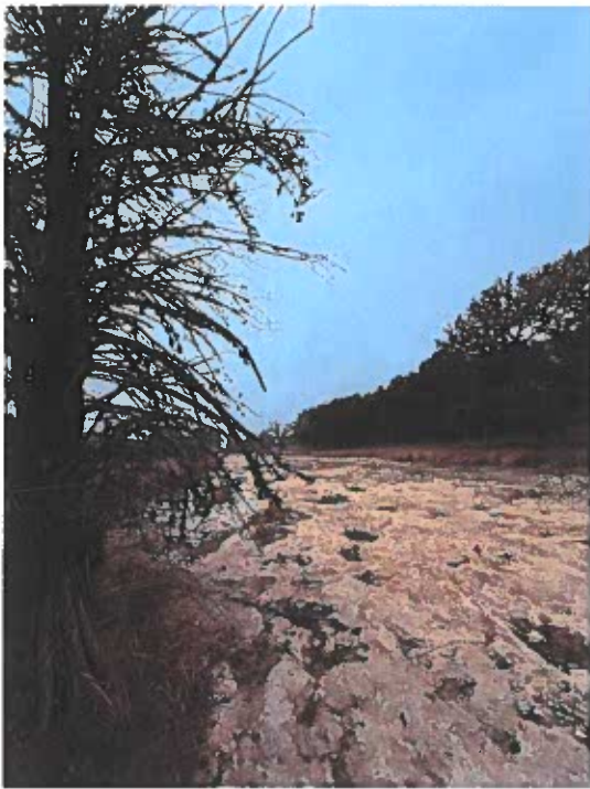
Sabinal River near Utopia, TX @ SH 187