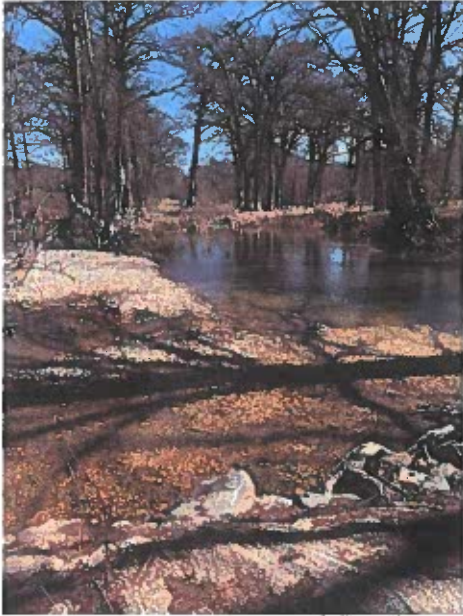
Medina River @ Peaceful Valley Rd

440 FM 3240 Bandera, Texas 78003 (830) 796-7260 Fax (830) 796-8262 www.bcragd.org