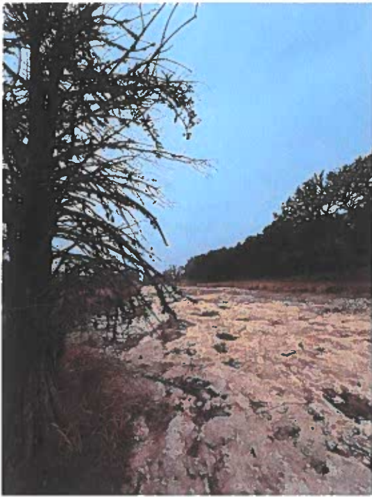
Sabinal River near Utopia, TX @ SH 187