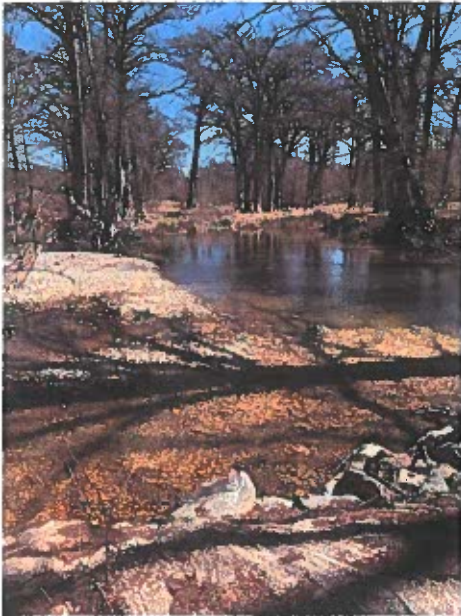
Medina River @ Peaceful Valley Rd

440 FM 3240 Bandera, Texas 78003 (830) 796-7260 Fax (830) 796-8262 www.bcragd.org